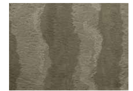
Opera Cat Z181111-3