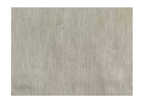
Opera Cat Z181113X-1