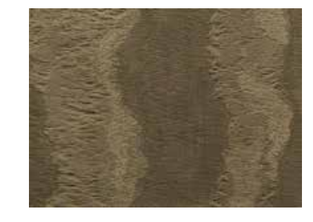
Opera Cat Z181111-4