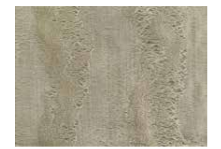
Opera Cat Z181111-1