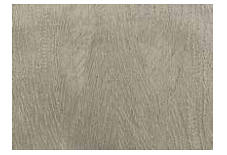
Opera Cat Z181114X-1