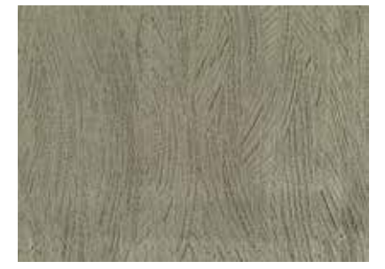
Opera Cat Z181114X-3