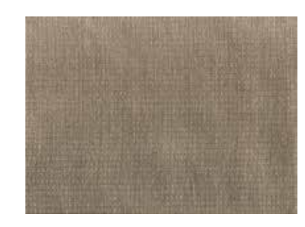
Opera Cat Z18111X-4