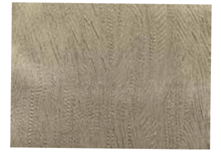
Opera Cat Z181114X-2