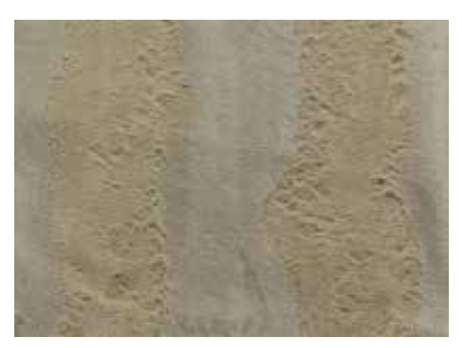
Opera Cat Z181111-2