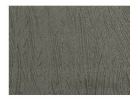
Opera Cat Z181114X-4