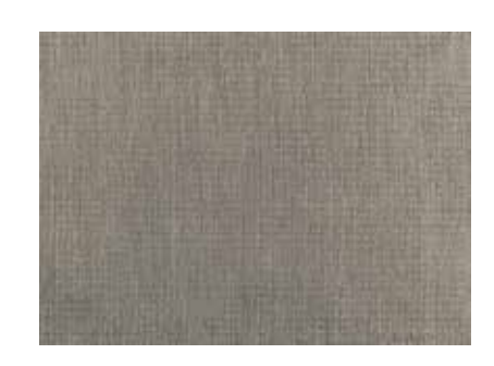
Opera Cat Z181113X-5