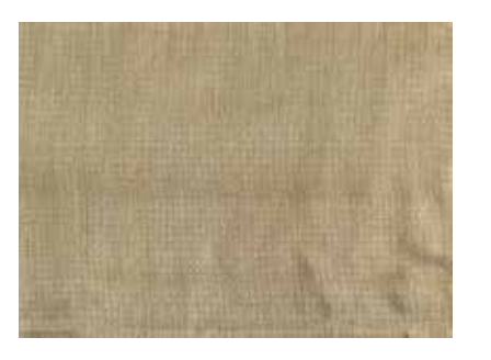
Opera Cat Z181113X-2