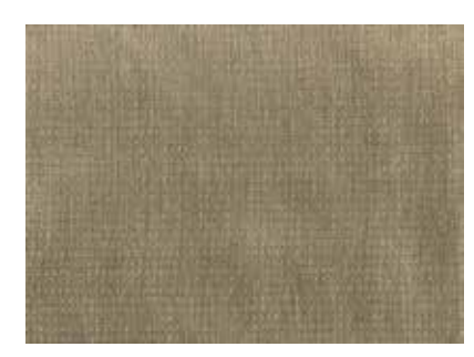
Opera Cat Z181113X-3