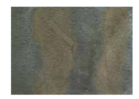
Opera Cat Z181111-5