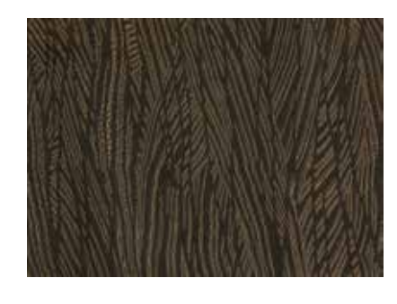
Opera Cat Z181114X-5