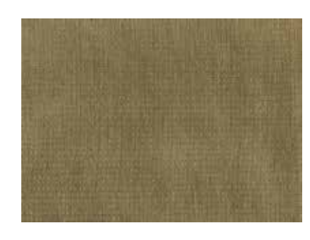
Opera Cat Z181113X-6